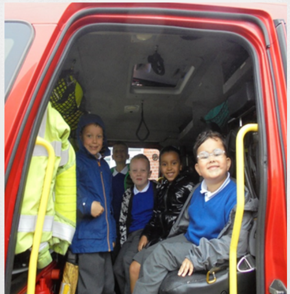
Years 1 and 2

As we are getting to know the children, we will soon be looking at allocating them to their class. Please keep an eye out for this information over the next few weeks.