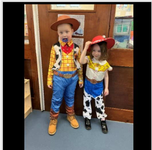
Woody & jessie!

Later in the term, we will be having a visit from The Animal Man, please keep an eye out for a letter and consent form for this!